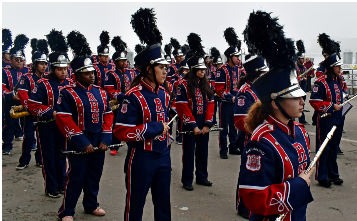
Members of the Richmond High marching band perform at the Richmond Ferry launch celebration on Jan. 10, 2019.

Richmond High's inspiring young band director won an emerging educator award this month from the California Music Education Association, a recognition that doesn't surprise his students or the school district in the least.